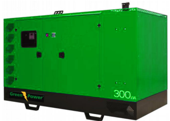
The image is only for demonstration purposes