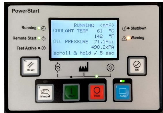
PowerStart 600 control operator/Display

Note: Please, refer to PS0600 product literature for additional Information on Control System.